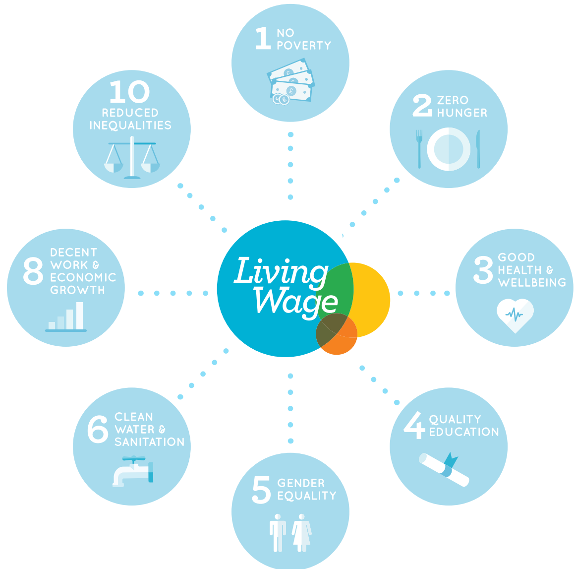
THE LINK BETWEEN THE PROVISION OF A LIVING WAGE AND VARIOUS SDGs

The security provided by a real Living Wage, therefore, also underpins many of the wider ambitions represented in the SDGs, such as good health and wellbeing, quality education and gender equality. The graphic below, prepared by SHIFT, suggests that the Living Wage is crucial to eight of the 17 SDGs.